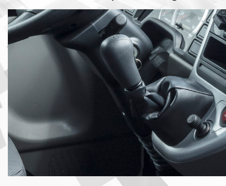
First-in-class dash-mounted gear shift lever