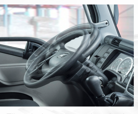
Tilt and telescopic steering wheel

Dimension (Length x Width x Height): 10ft x 6ft x 1ft